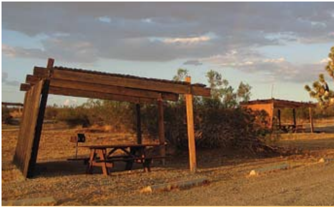
Campsites at sunset

the peak and enjoy a 360-degree view over Antelope Valley and the Mojave desert.