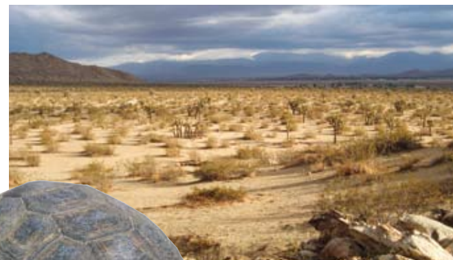
Mojave desert rain clouds

Daytime visitors may see foxes, rabbits and desert tortoises—a burrowing reptile and threatened species. Beware of desert rattlesnakes searching for rodents in the evenings. Among rattlesnakes, Mojave “green” rattlers have the most toxic venom while Mojave sidewinders have the least toxic venom.